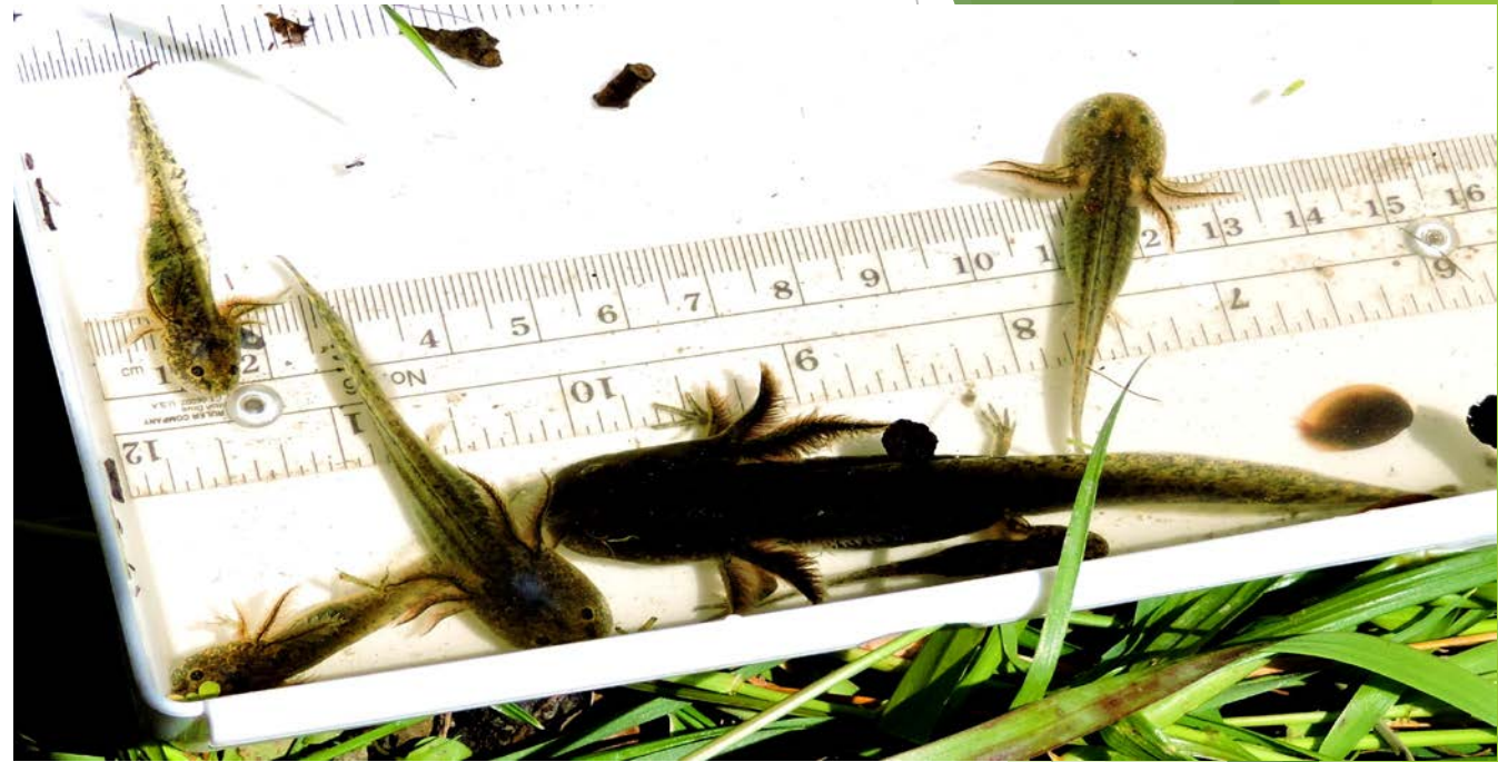
California Tiger Salamander